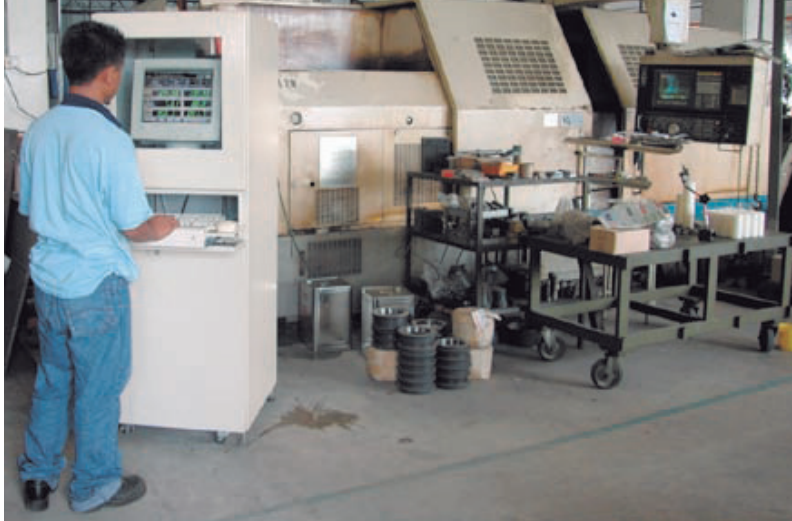
PC Enclosure protects computer in workplace.